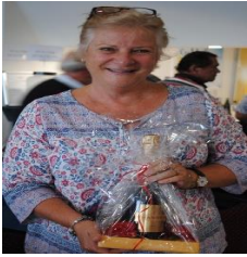
LUCKY DOOR !