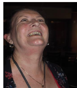
Dance as if no one is watching – Girls just want to have fun!