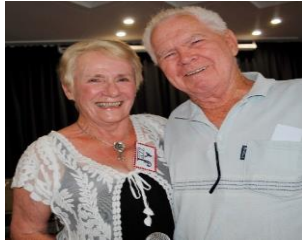
WINNERS ARE GRINNERS – RAFFLES OCTOBER