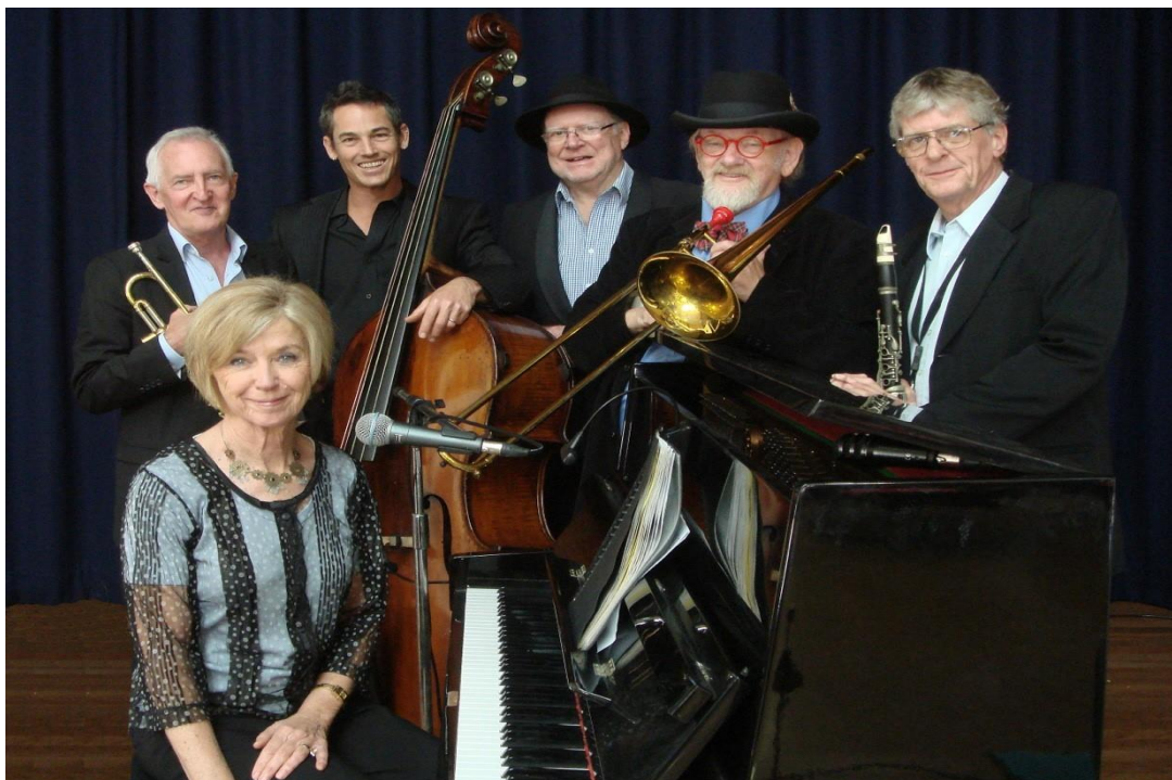
CALOONDRA POWER BOAT CLUB 1 JULY

CAXTON STREET JAZZ BAND – No introduction need here!