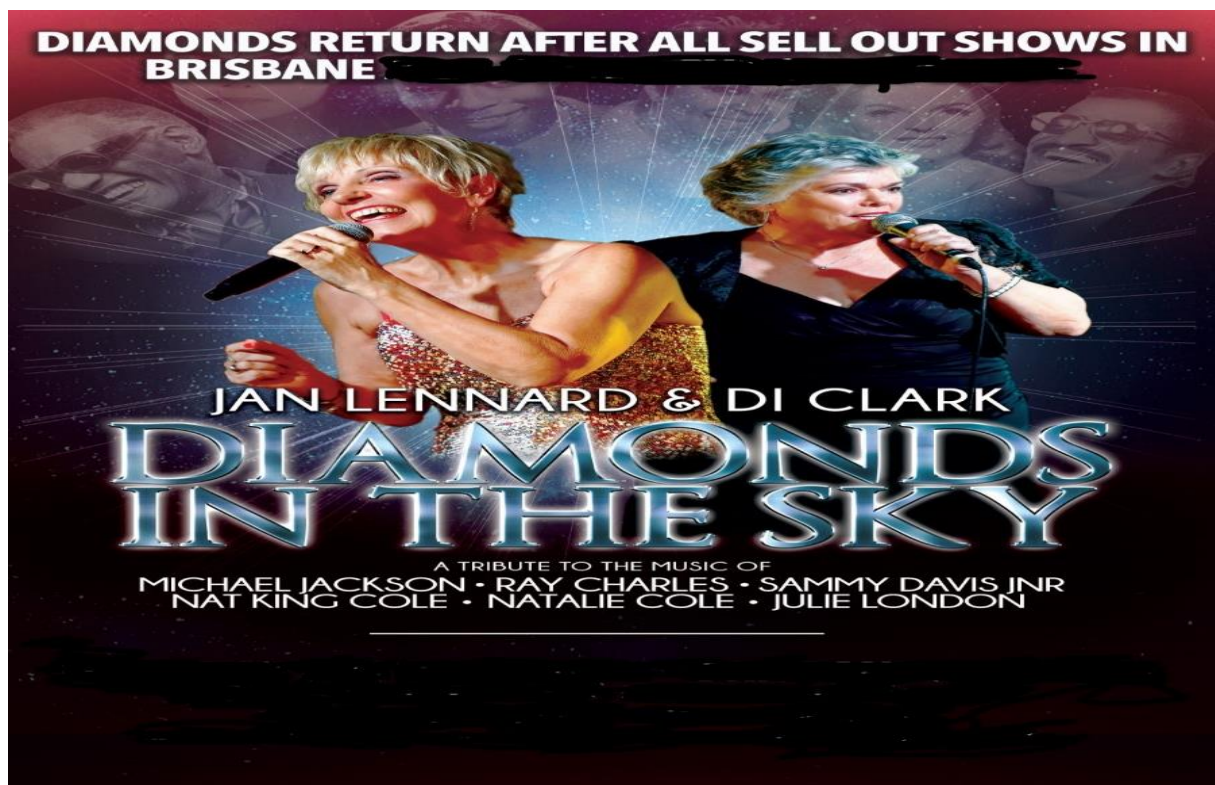
CALOONDRA POWER BOAT CLUB 15 th July