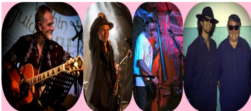
THE CLARENCE JAZZMEN