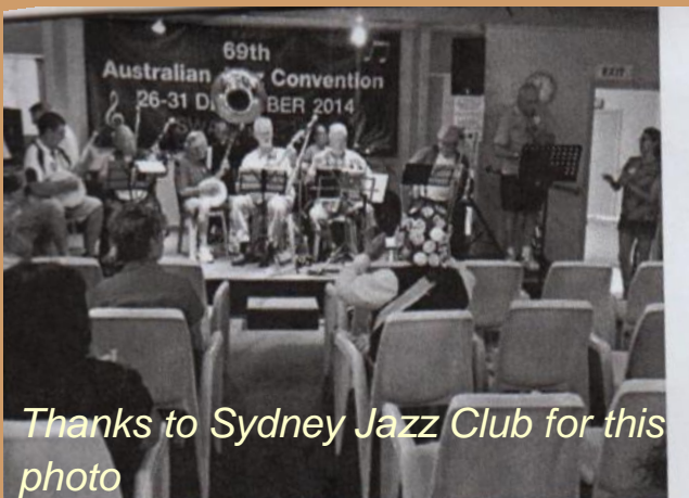
Thanks to Sydney Jazz Club for this photo

A special thanks to all at Lake Kawana for your help and art work. We dig!