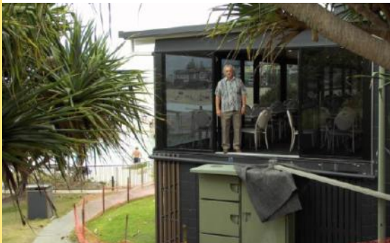
Up on the 1st floor, doors to the new deck

the club with a million dollar view. All the ocean boats - that's where they turn to go to Brissy. 2 boats one going one returning. You are sitting enjoying your meal, they look too close, they turn on a tray bit true. The inside of the club is just finished. Come and see for yourself - like WOW! 1 @ month we will be celebrating when finishing, hopefully by Aug/Sep 2015, a jazz brekky on the deck? the early bird gets the worm www.caloundrasurfclub.com.au It's all happening at the fishing village known as Caloundra today. At the Kings Beach a yearly festival all surf clubs are there, nippers all ages to adults a family get together. Once a year the beach is closed to the swimmers. All those years ago trucks on the beach, blokes in rowing boats dropping nets in to the sea to catch mullet, that come from the passage and where ever, they know when to haul them in, they row out to check the nets, they hook up to the truck, all men on each net to help the tug of war it's a sight unreal, you are allowed to take pictures some of these blokes, the saying old sea salts.