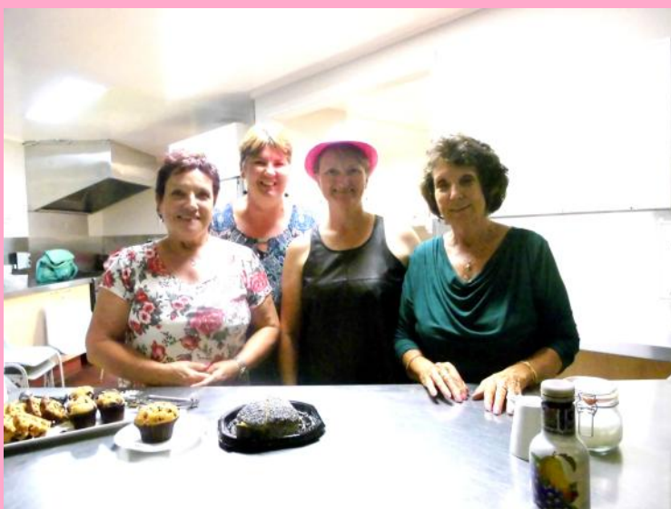
All our Pink Ladies in the kitchen