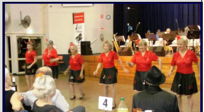
The Tap Katz